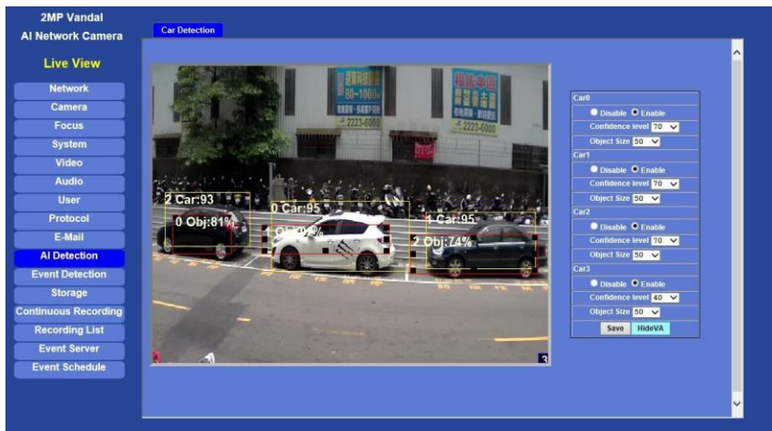
< Car detection and DO control >