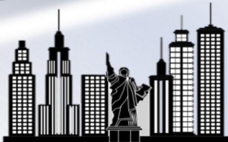
AI EEWS Station