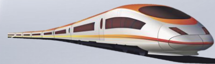
High Speed Rail