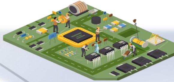
High Tech Plant