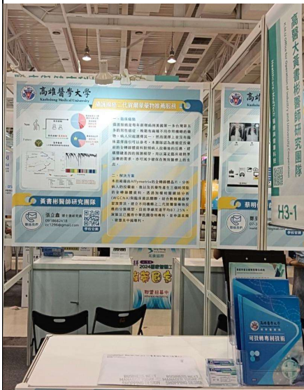
2024 Meet Greater South 亞灣新創大南方展覽會