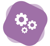
Medical peripheral devices (software & hardware)

Contact us if you have any enquiries in smart healthcare solutions.