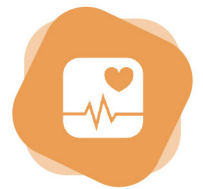
Medical service system