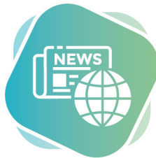
Latest industry news