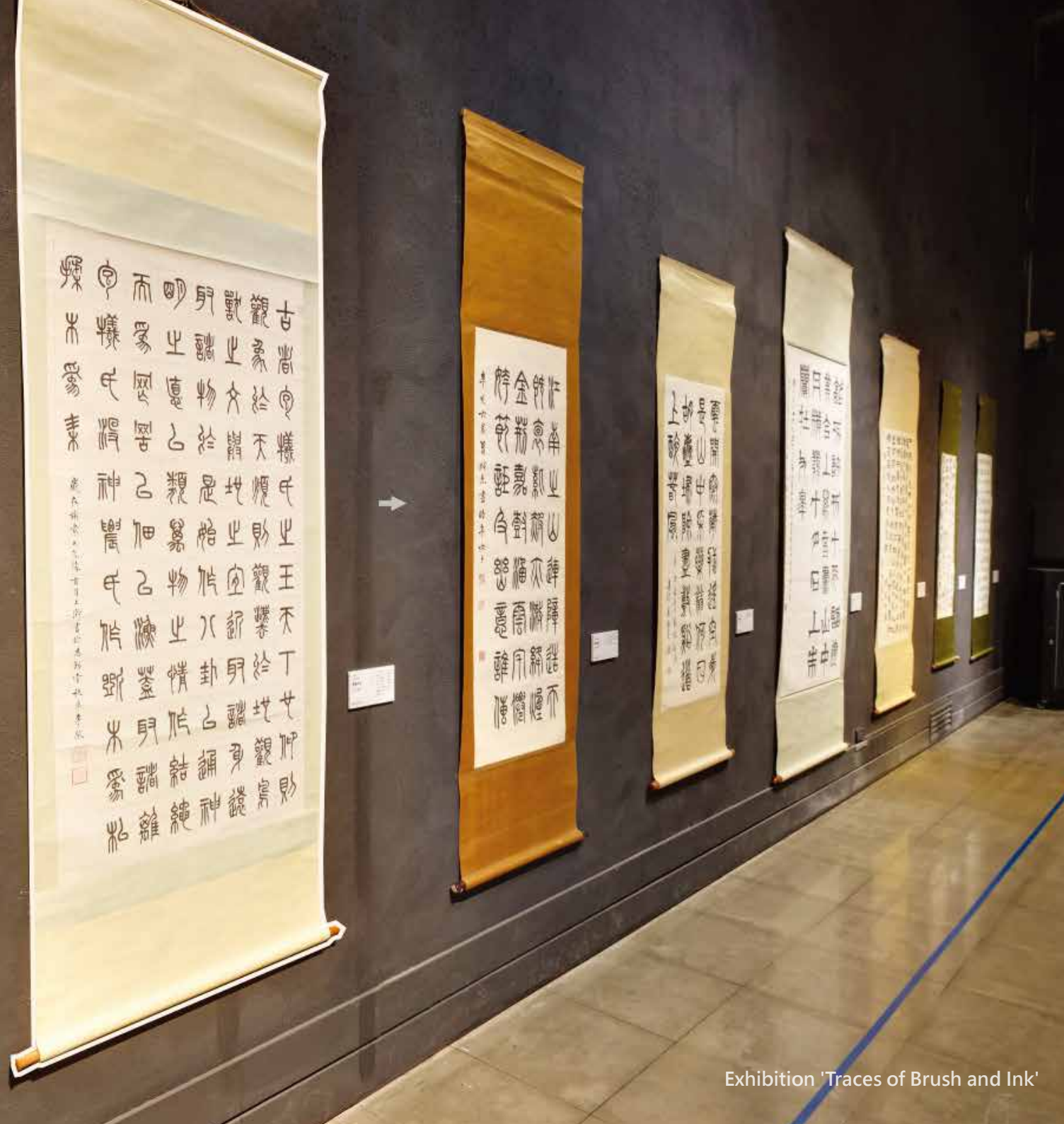
Exhibition 'Traces of Brush and Ink'

We are now releasing this rare opportunity to media companies around the globe, having our design team to cooperate with your photographers to build exceptional VR websites.