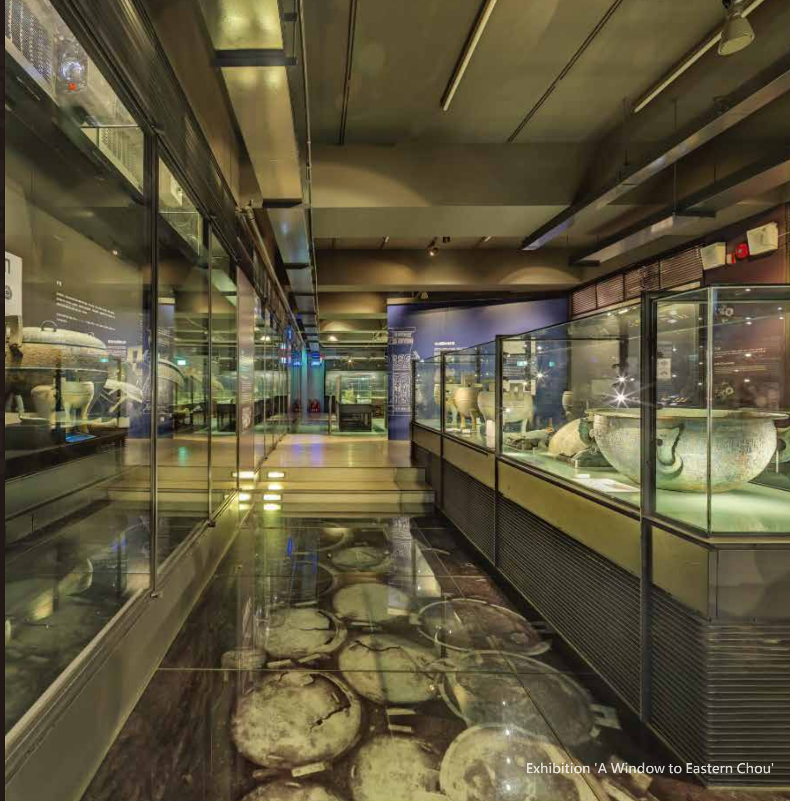
Exhibition 'A Window to Eastern Chou'

Well experienced in designing UI & UX, Panosensing is able to provide highly customized VR Guiding Website according to customers' needs.