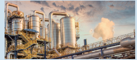
Yield and Quality Improvement